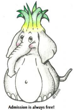
Admission is always free!

Parade check in 8:30am Parade begins 10am