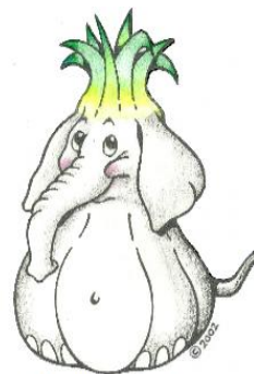
Admission is always free!

Parade check in 8:30am Parade begins 10am